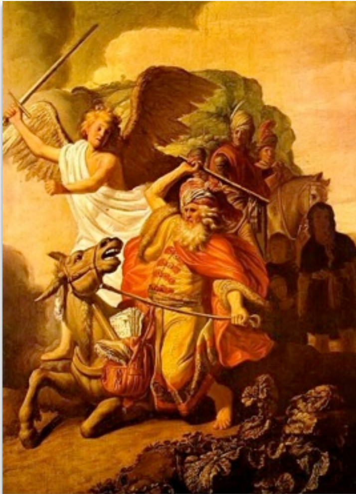
Balaam and the Ass by Rembrandt, 1626

A Quarterly Newsletter supported by Christian fellowship Church.